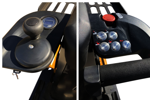
Left hand controls

The right-hand operator control pod features fingertip lift/lower buttons for the operator platform, front load tray, horn, and travel. Also included is a recessed emergency power disconnect. On the left-hand control pod, the steering tiller, battery discharge indicator with hour meter and key switch are provided.