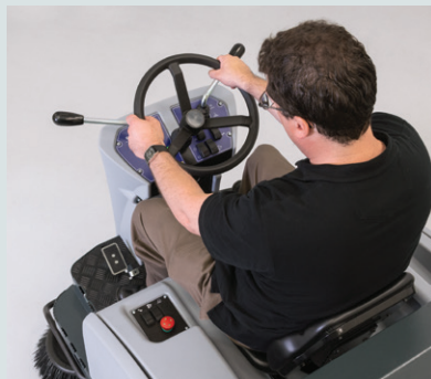
Clear-View™ enhances operator safety.