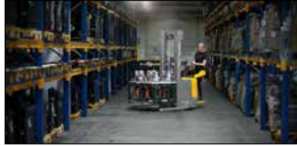
ERC operator position