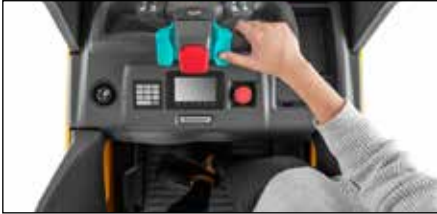
ERC storage controls and compartment