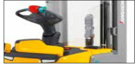
Easy-to-operate main connector for on-board charger