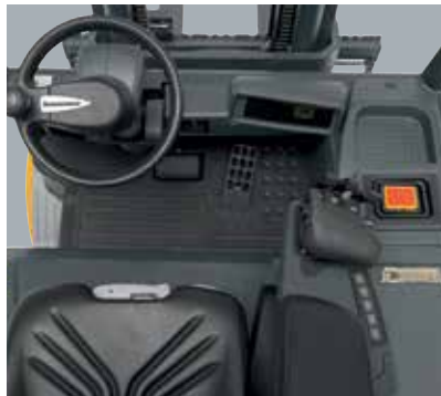
Ergonomic operator compartment