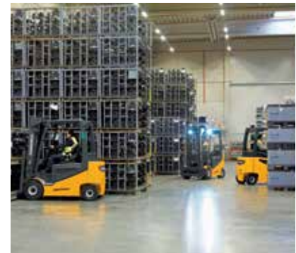
Speed reduction during cornering