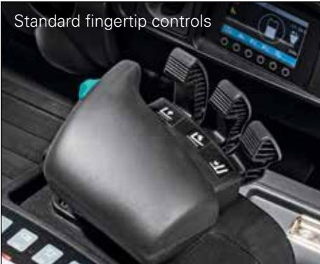
Standard fingertip controls

The lift truck's smart design provides visibility to the work area. The open layout of the overhead guard, and slim mast profile, offer forward visibility when driving and lifting. Programmable forward work lights provide ample lighting for various work environments.