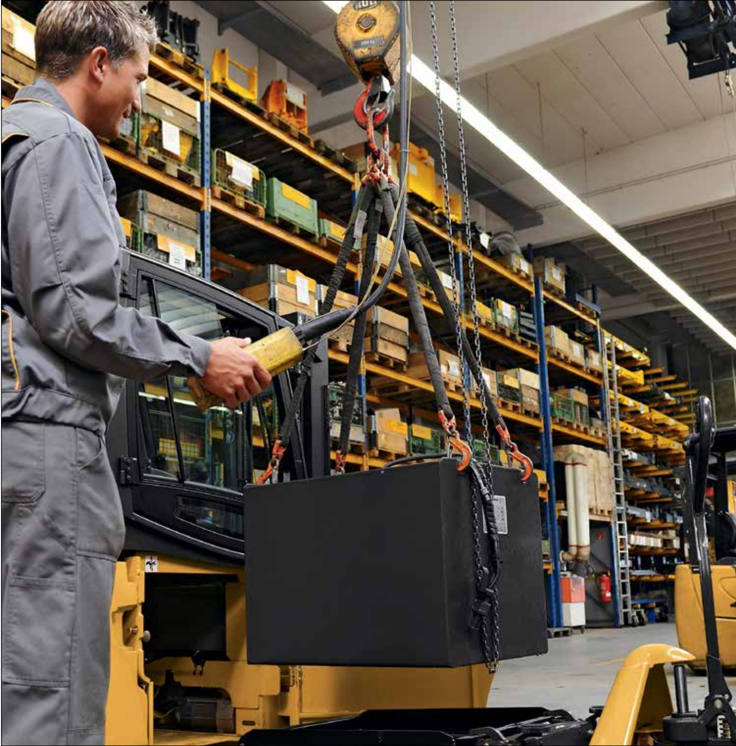
Crane Extraction with SnapFit