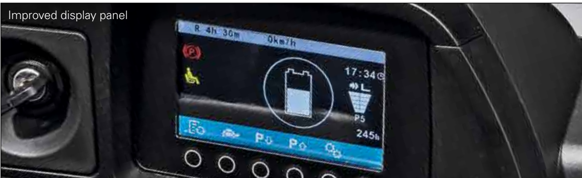
Improved display panel

Standard fingertip hydraulic controls – featuring an integrated direction switch and horn for low-effort handling and precise control.