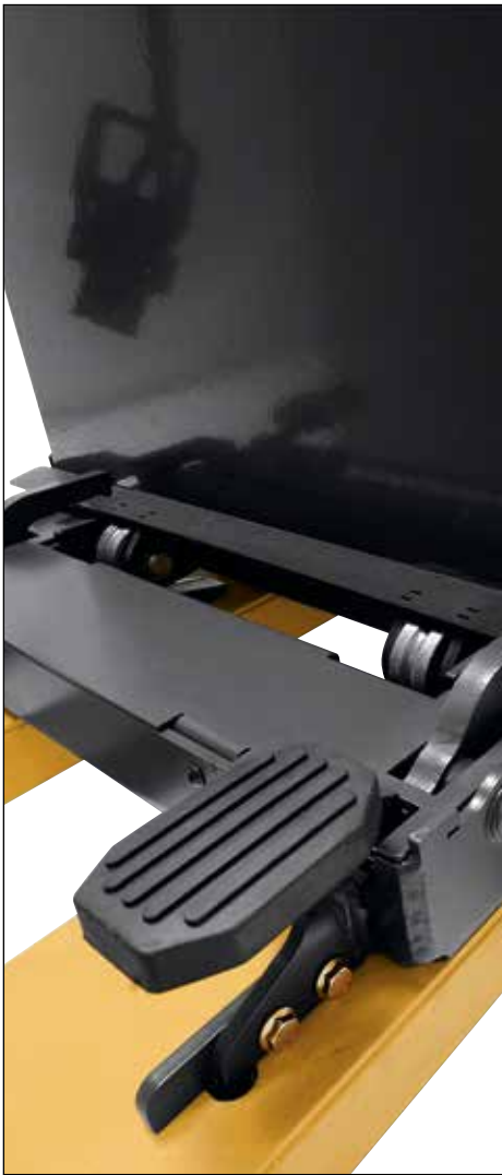
Pallet Jack Extraction with SnapFit