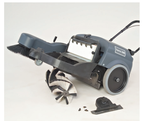
Tools-free removal of brooms and hopper makes for easy maintenance.