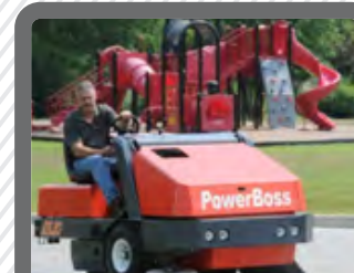
Universities • Hospitals Municipalities