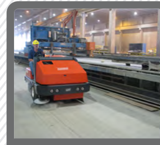
Manufacturing • Distribution