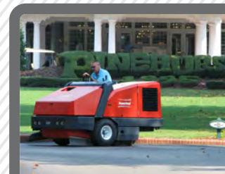
Hotels • Resorts Special Event Venues